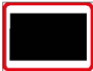
Operator Identity (Logo) Sign