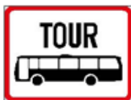
Tour Bus Sign