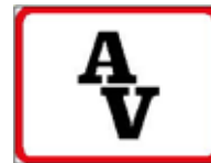
Abnormal Vehicle Sign