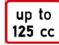
Motor Cycle Engine Size Limit