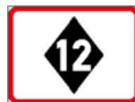
High Occupancy Vehicle Sign