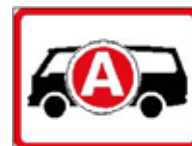
Emergency Vehicle Sign