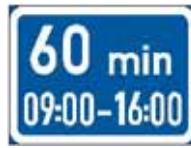
Maximum Stay During Time Limits