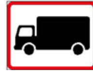
Goods Vehicle Sign