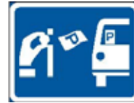
Pay and Display Sign