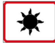
Day Condition Sign