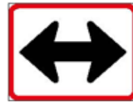
Reserved Movement Left and Right by Vehicle Class