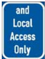
'Local Access Only' Limit Sign