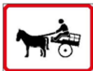
Animal-drawn Vehicle Sign