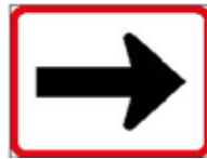
Reserved Movement Right by Vehicle Class