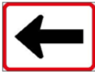
Reserved Movement Left by Vehicle Class