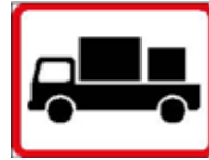
Delivery Vehicle Sign