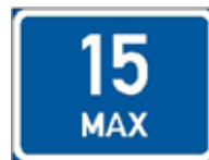
Maximum Number of Vehicles