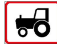
Agricultural Vehicle Sign