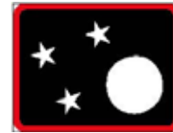
Night Condition Sign