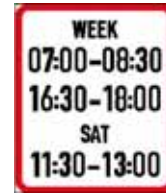
Three Periods or Days Limit