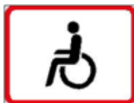
Disabled Persons Vehicle Sign