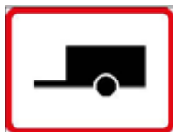
Towed Vehicle Sign