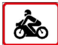
Motor Cycles Sign