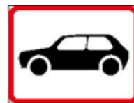
Motor Cars Sign