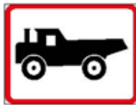
Construction Vehicle Sign