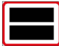
Operator Identity (Words) Sign