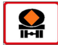
Vehicle Conveying Dangerous Goods Sign