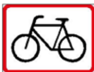
Pedal Cycles Sign