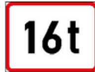
Mass Limit Sign (Text)