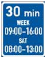
Maximum Stay During Time Limits