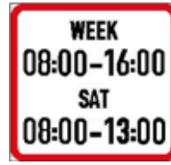
Two Periods or Days Limit