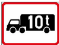
Goods Vehicle over Indicated GVM Sign