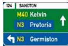
Crossroad Advance Direction