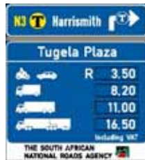
Far-side Advance Direction Toll Tariff Combination