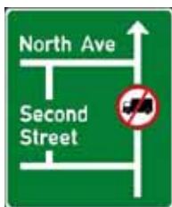
Map-type Advance Direction