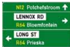
Stack-type Composite Direction