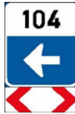
Gore Exit Direction