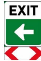
Gore Exit Direction