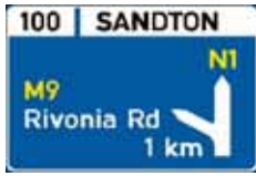
Advance Exit Direction