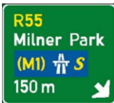
Overhead Advance Direction